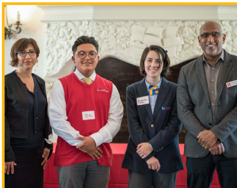
In-person practice helped the transition to remote work

COVID-19 continues to alter the way we work and live, but our Corporate Work Study Program swiftly adapted to new paradigms. When shelter-in-place was announced in March, student associates didn't miss a beat!